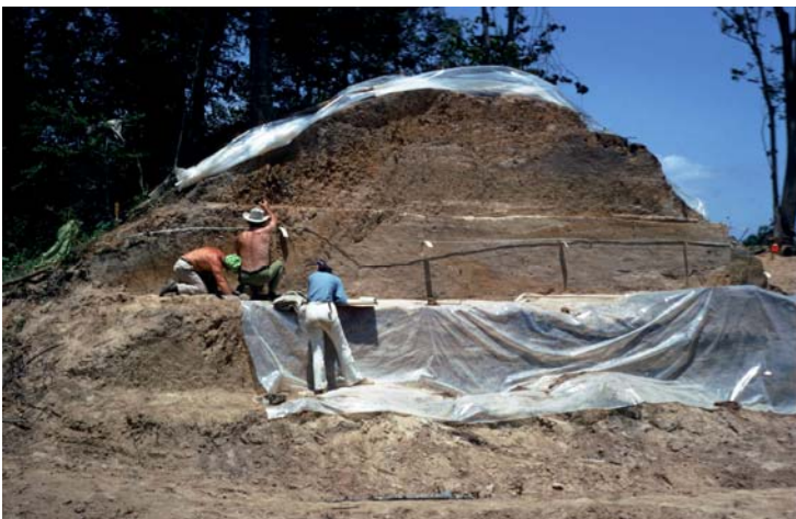
Above: Excavations underway—archeologists & volunteers clean the face of a mound at the Ferguson site in 1973.