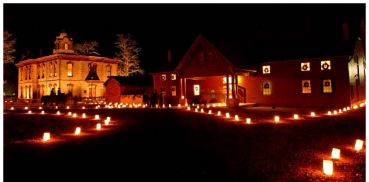
"Christmas and Candlelight" at Historic Washington State Park.

Historic Washington State Park, a restoration village preserving one of Arkansas's most prominent 19 th -Century towns, is located on US 278 nine miles north of Hope and can be reached by taking Exit 30 off Interstate 30. For more information visit or call (870) 983-2684.