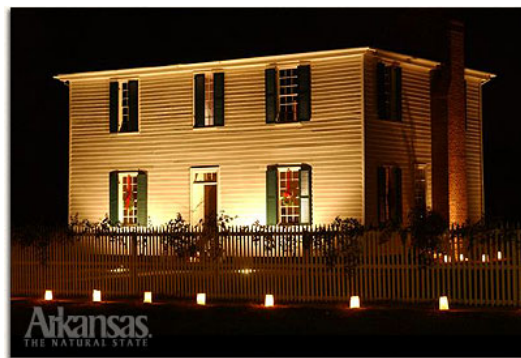
"Christmas and Candlelight" at Historic Washington State Park.