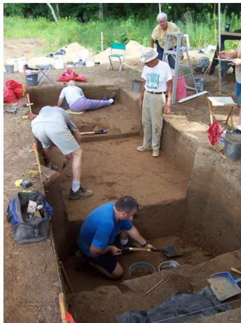
Arkansas Archeological Society members working during the 2007 Summer Training Program near Malvern, Arkansas.

The annual Training Program and excavation has been conducted at various sites throughout Arkansas since 1972. The 2008 Training Program will continue our 2007 investigations of Archaic period novaculite stone tool manufacture and exchange. The Jones Mill Site, which is listed on the National Register, may have served as a home base during Middle and late Archaic periods for local groups of hunter-gatherers who worked novaculite from nearby quarries. The excavation will be important for studying Archaic-period lifeways in the middle Ouachita River valley and for documenting the role that novaculite tool production played locally and regionally.