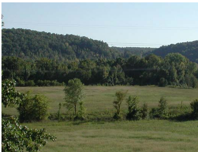
A view of the Jones Mill site (3HS24) near Malvern, Arkansas. The Arkansas Archeological Society Dig and an UofA/HSU archeological field school will be excavating here for the second year in a row this June.

The field school is open to current and visiting or guest students. Students can enroll through University of Arkansas (6 credit hours, Summer 5 term, Division of Continuing Education) in Anthropology 4256 (undergraduate, $184 per credit hour) "Archeological Field Session" or Anthropology 561V (graduate, $305 per credit hour), "Field Research in Archeology," or through Henderson State University (6 credit hours, Summer Session I) in Anthropology 3096 (undergraduate, $154 per credit hour plus fees) "Archeological Field School." The summer field school will run from June 2 to July 3, 2008 , with work at the site or field lab on Mondays through Fridays. Students will be able to arrange for housing on