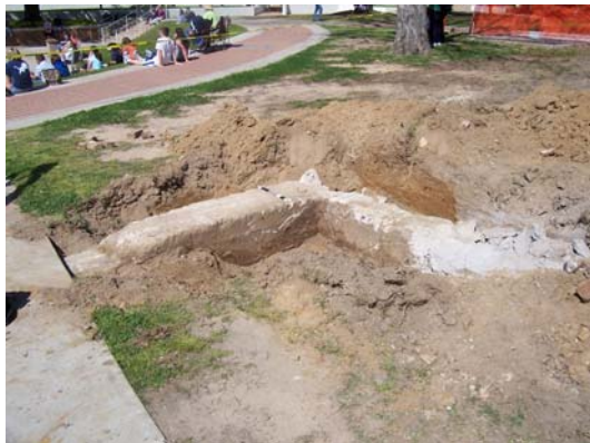
A portion of the concrete foundation of what is believed to be Holt Hall on the SAU campus.