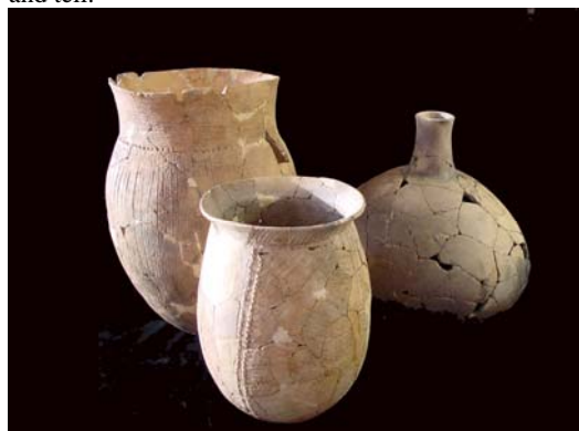
Some Caddo ceramic vessels recovered from one of the house floors during the Grandview excavations.

The meeting will be held Tuesday, May 8, 2007 in room 104 of the Bruce Center on the Southern Arkansas University campus. The talk will start at 7 pm, but come early and bring your artifacts for “show and tell.”