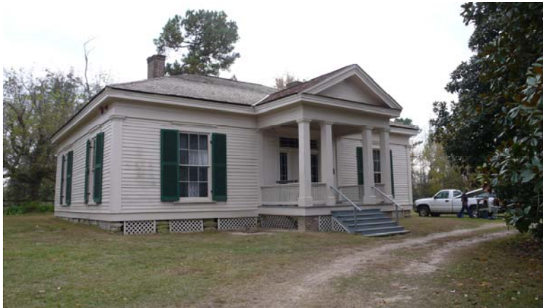
Spring Break excavations at the Royston House in Historic Washington State Park will run from March 15-21, 2008.

have been discovered under the direction of the Arkansas Archeological Survey and Society at Washington over the