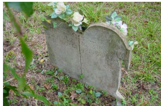
Turn of the century grave markers at the Craven Cemetery near Prescott in Nevada County.