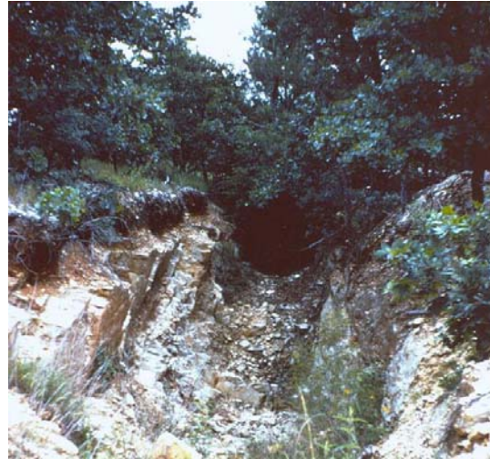
Prehistoric novaculite quarries such as this one near Hot Springs figure into the research design of our excavations this summer at Jones Mill.