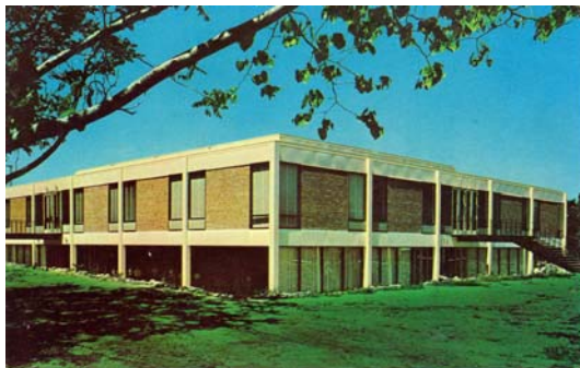
The Bruce Center: Future home of the SAU Museum.

Several private donations have already been made to the SAU Foundation and the AAS staff has plans for applying for grant monies this spring's grant cycle.