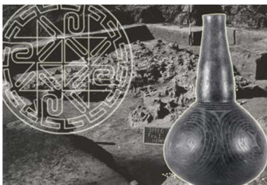
Join the Southwest Arkansas Archeology E-Mail List!