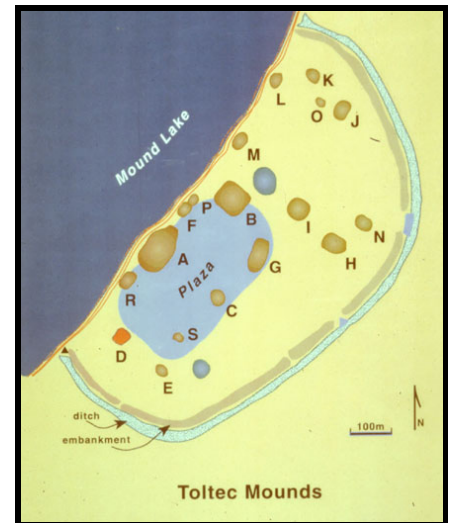
A map of Toltec Mounds showing the mounds, plaza and ditch/embankment.

Although mound-building was a part of Southeastern Indian cultures in centuries prior to the construction of the Toltec Mound site, the types of mounds (platform mounds that supported structures), the number of mounds, and the sheer size of the Toltec Mounds site was unusual for the Late Woodland period. Radiocarbon dates indicate that most of the construction of the elaborate ceremonial landscape at Toltec Mounds probably took place during the AD 800s and 900s. The early manifestation of